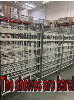
The shelves are bare!