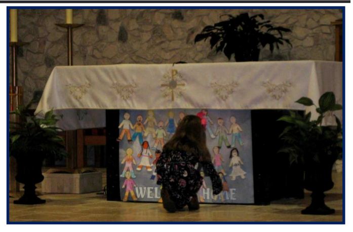
Congratulations to our Second graders who made their First Penance on February 21.