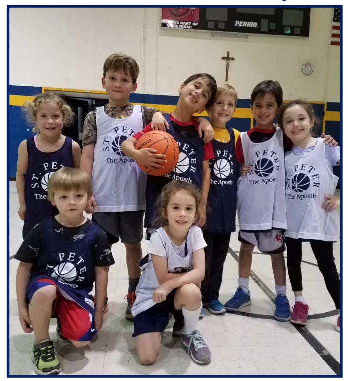
Intramural Basketball is underway! Kindergarten and First graders are ready for the season!

TOGETHER we live, pray, learn and serve, TOGETHER we make a difference. P.O. Box 30460 7020 Concord Road Savannah, Georgia 31410 school@spasav.net p. 912.897.5224 f. 912.897.0801