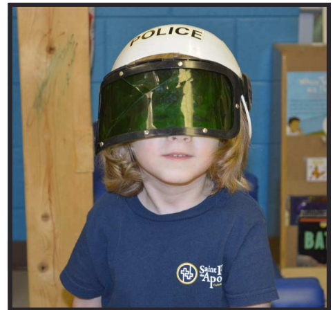
BELOW: Pre-K 4 learns about Law Enforcement Officers during their Community Helpers Unit.