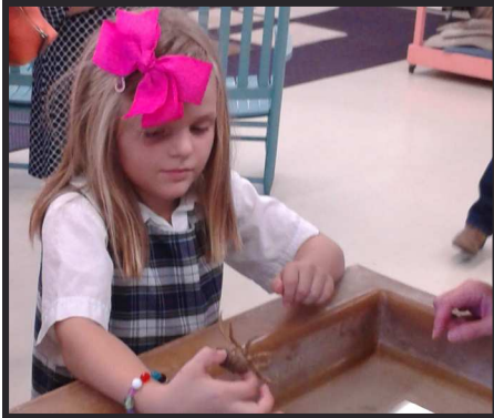
Second & Third Grade Classes visited the Skidaway Island Marine Science Museum on 10/21/14